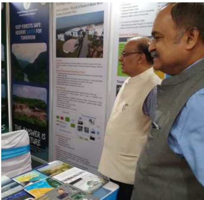
Additional Chief Secretary, Forest & Environment Department, Government of Gujarat at the GEC-ENVIS Hub stall

Every year March 22 is celebrated world over as the World Water Day. To celebrate the same, ENVIS Centre of Gujarat Ecology Commission in association with Water and Sanitation Management Organization (WASMO) organized an exhibition at Gandhinagar on March 22, 2018. The exhibition was on the theme, Nature for Water and we had displayed posters and publications relevant to the theme. The exhibition focussed on water crisis and ways to save water. The exhibition was inaugurated by Hon'ble Chief Minister of Gujarat Shri Vijay Rupani. More than 1000 people, like villagers, NGOs, government officials and industrialists from different parts of Gujarat state visited the exhibition.