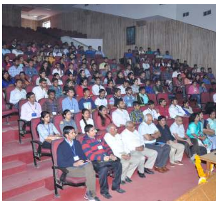
Participants of workshop at Institute of Science & Technology for Advanced Studies & Research, Anand