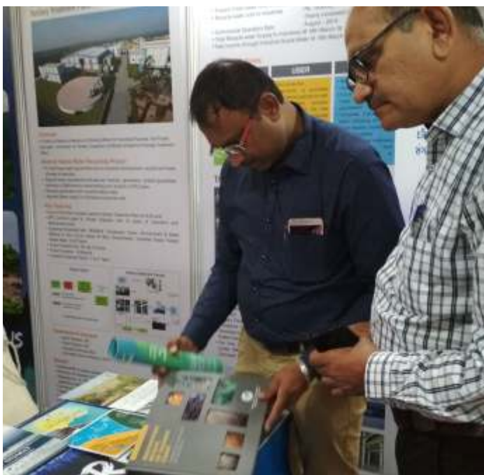
Participants at GEC-ENVIS hub's IEC stall