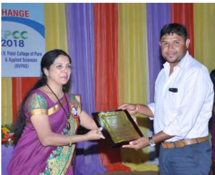
Information Officer, GEC-ENVIS hub at ISTAR, Anand