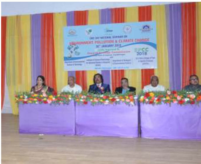
Experts taking session on Environment Pollution & Climate Change