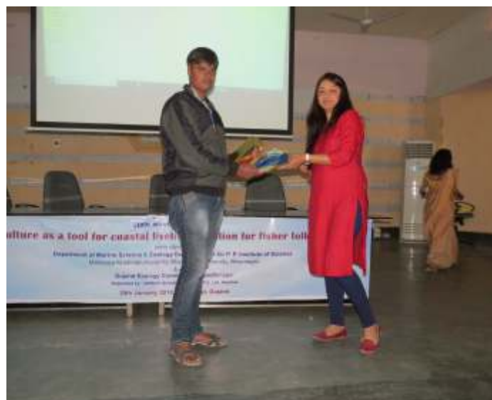
Programme Officer, GEC-ENVIS hub at Bhavnagar University