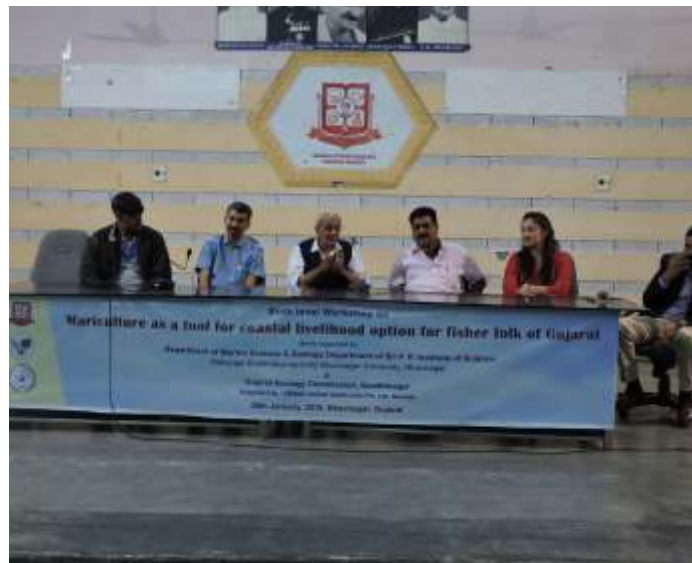
Panel sharing thoughts on mariculture at Bhavnagar University