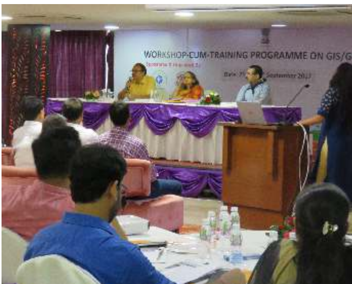
Participants of the workshop on GIS-GEO mapping