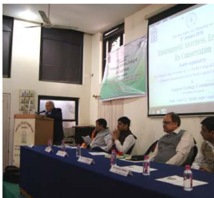
Session in progress on Environment Awareness, Ecology & Its Conservation at Palanpur