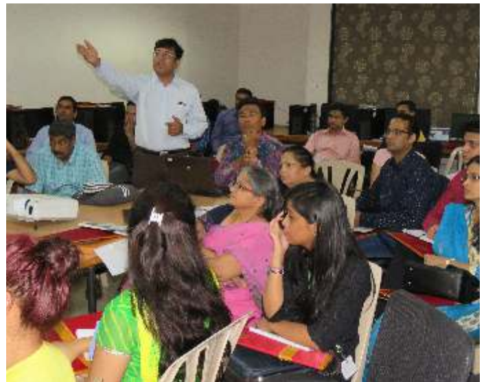
GIS Expert of BISAG taking session on mapping