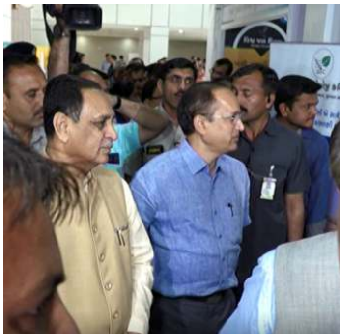
Hon'ble Chief Minister of Gujarat, Shri Vijay Rupani visiting the stall