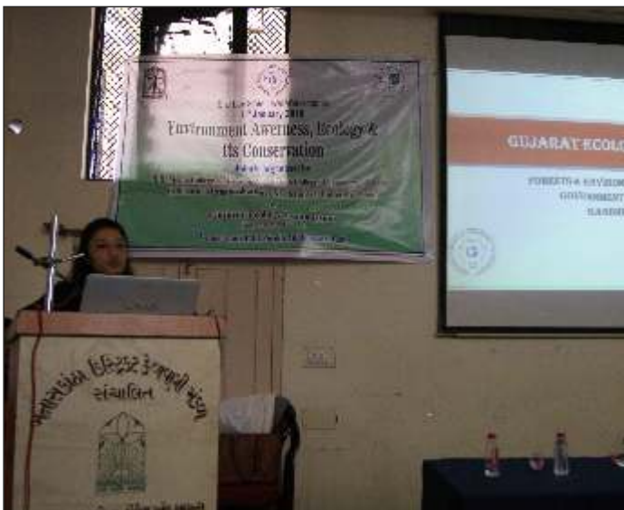
Session on ecology & conservation