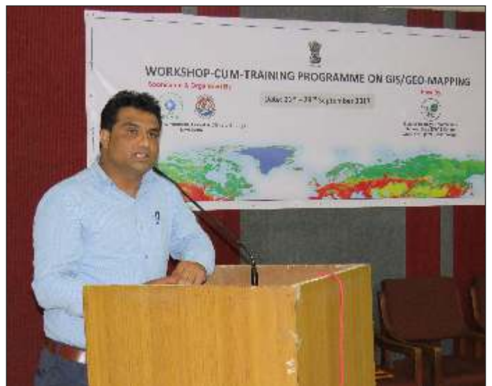
Coordinator, GEC-ENVIS Hub sharing views on GIS-GEO mapping