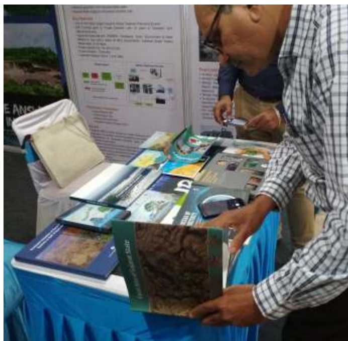
Showing keen interest in publications of GEC-ENVIS hub