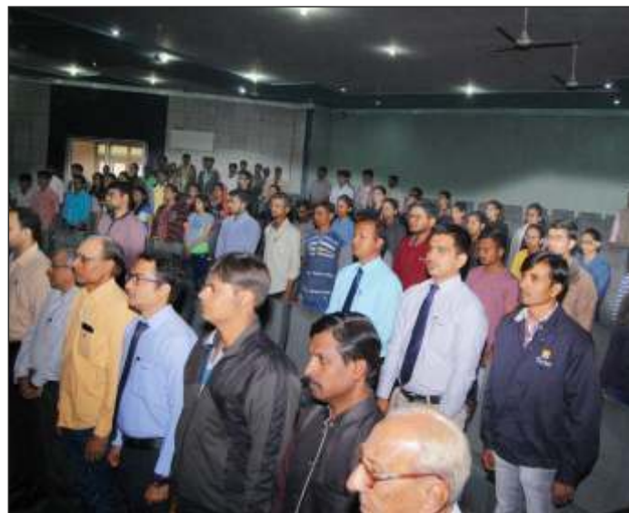
Participants of workshop at Bhavnagar University