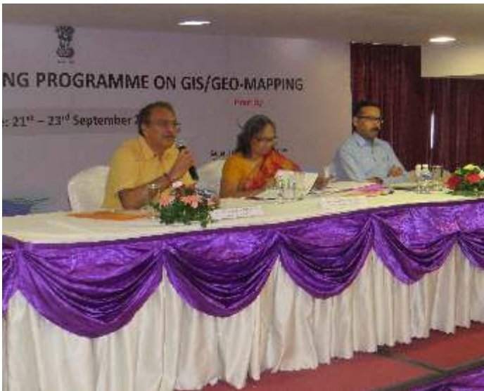
Member Secretary, GEC addressing the participants

ENVIS Centre of Gujarat Ecology Commission had extensively organized a workshop cum training programme on GIS – GEO mapping at Gandhinagar, Gujarat from September 21 to 23, 2017. The sessions on GIS-GEO mapping was conducted by experts from Bhaskaracharya Institute for Space Applications and of Geo-Informatics (BISAG). Around 180 participants from different ENVIS centres of the country attended this training programme. The training focussed on district level data mapping and on methodology for valuation of ecosystem services, estimation of carbon stock and sequestration and other approaches.